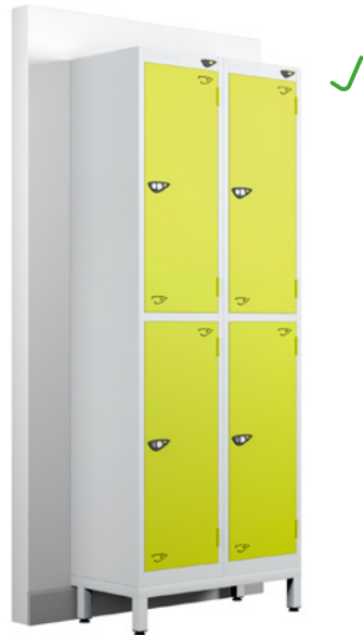
01 Locker stand elevating above obstruction