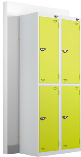
BACK TO WALL