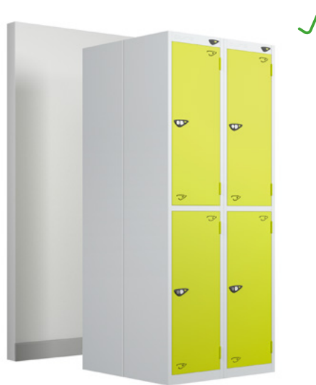
BACK TO BACK